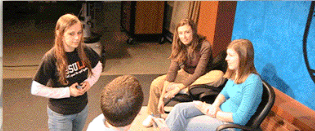
BSU Late Night Television aired pilots for The Higgens Network